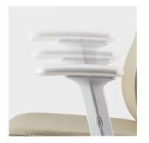
Armrest height adjustment